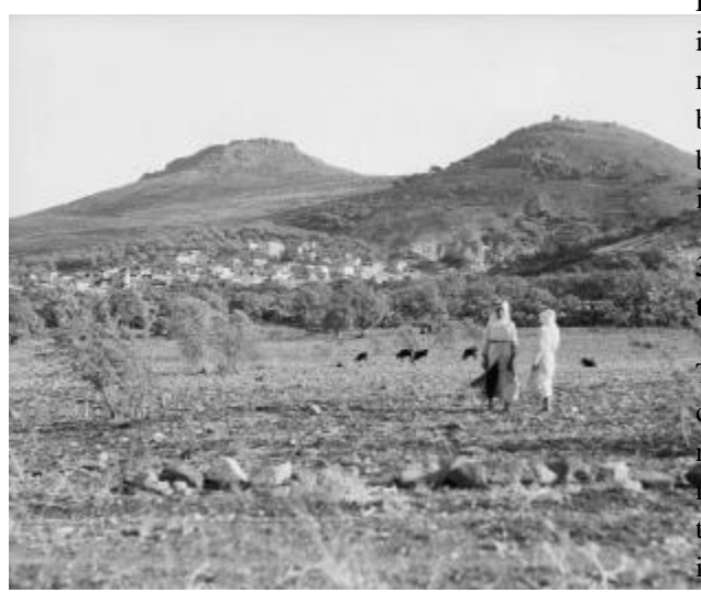
Karn Hattin, traditional location of the Sermon on the Mount

The translators have rendered this "a mountain," viz., no special mountain, just one near the place they were at. However, the Greek uses the definite article to opo "the mountain," seeming to signifying a distinct mountain; viz., one that was familiar to the disciples (cf. Matt. 15:29-39). Tradition assigns this to Karn Hattin (the "Horns of Hattin"), the only height rising above the hills surrounding the shores of Lake Gennesaret, about five miles to the west. This mountain is named for the village now at its base and for the two horns that crown its summit, separated by a level place in between, which could have accommodated the multitudes that followed Christ. It also corresponds with Luke's description of a level place or plain (τοπουπεδινου) where the Sermon on the Mount was delivered (Lk. 6:17).