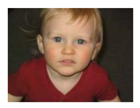
Except ye be converted and become as little children, ye shall not enter into the kingdom of heaven. Matt. 18:3