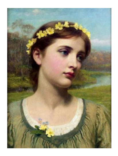
Say NO! to anti-feminine feminism!

Feminism has destroyed the flower of feminine grace and beauty.