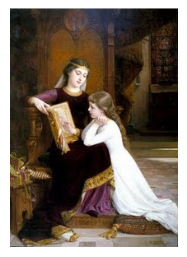
No more pants and slovenly modern dress!