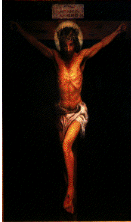
“God forbid that I should glory save in the cross of our Lord Jesus Christ.”