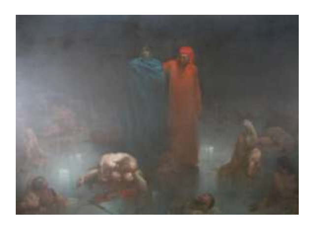
"There Shall Be Weeping and Gnashing of Teeth" (Matt. 25:30)