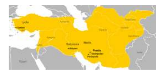
The Mede-Persian Empire was the largest the world had seen until that time

does not describe isolated incidents of wrath upon a single nation, but seems to be describe wrath worldwide in its sweep.