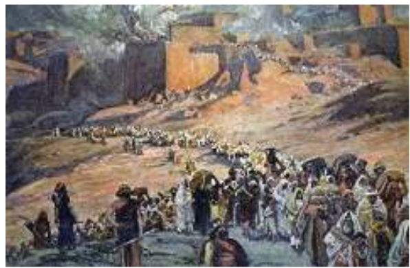
Nebuchadnezzar burns Jerusalem

Isaiah and Zephaniah describe the same time of judgment God was bringing upon the ancient world. The Assyrio-Babylonia invasions were like a great flood that rose up and spread across the world, sweeping away all before it (cf. Isa. 8:7, 8).