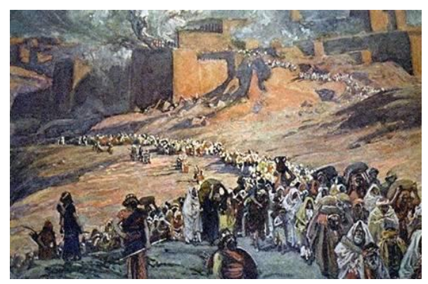
Nebuchadnezzar burns Jerusalem

Isaiah and Zephaniah describe the same time of judgment God was bringing upon the ancient world. The Assyrio-Babylonia invasions were like a great flood that rose up and spread across the world, sweeping away all before it (cf. Isa. 8:7, 8).