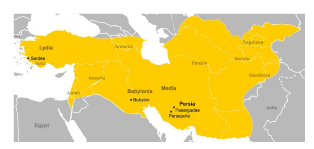
The Mede-Persian Empire was the largest the world had seen until that time

does not describe isolated incidents of wrath upon a single nation, but seems to be describe wrath world-wide in its sweep.