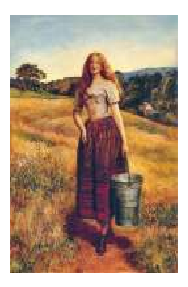
But if a woman have long hair is it her glory I Cor. 11:15

As the schools continue to fail, parents are beginning to realize the dangers of sending their kids to public school. Homeschool parents are realizing that they can do a better job in educating their kids—and they are doing just that. Homeschooling is an option that is available to parents if they are seriously committed to educating and teaching their children in traditional, biblical values America was founded on. If kids are not taken out of the failing public school system, America is likely to loose a generation of children.