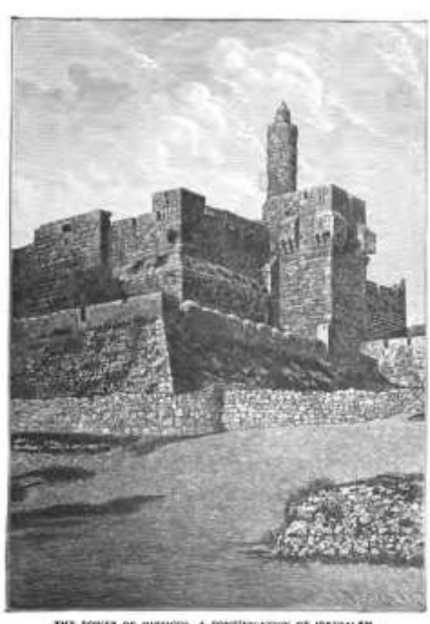
THE TOWER OF HIPPICUS, A PORTIFICATION OF JERUSALEM.

As Preterists, we are attempting to restore to the 21<sup>st</sup> century church the primitive faith and teaching of the Lord about eschatology. But what is restored eschatology if we fail to understand the very plan of salvation itself, and how men come to salvation in Christ?