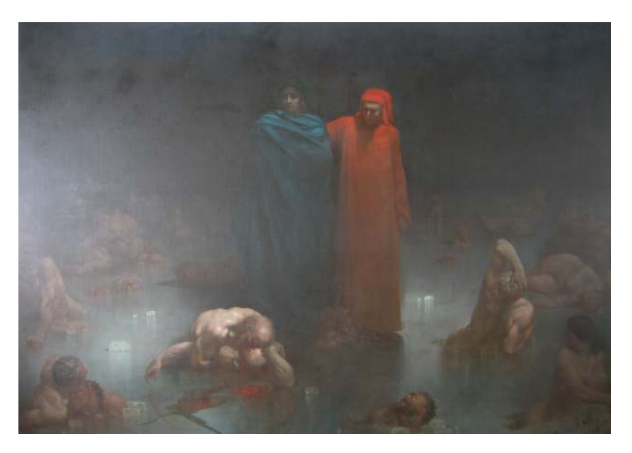
"There Shall Be Weeping and Gnashing of Teeth" (Matt. 25:30)

The three story pyramid of interpretation of Time Texts, Characters and Events, and Symbolic Language weave into a threefold cord that cannot be broken. We hope you will embrace Preterism as the only credible and defensible interpretive school of eschatology.