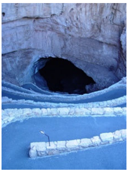
Natural descent into the caverns

By All Reports the Best Conference Most had Ever Attended!