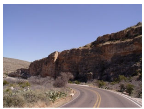
Road to Caverns