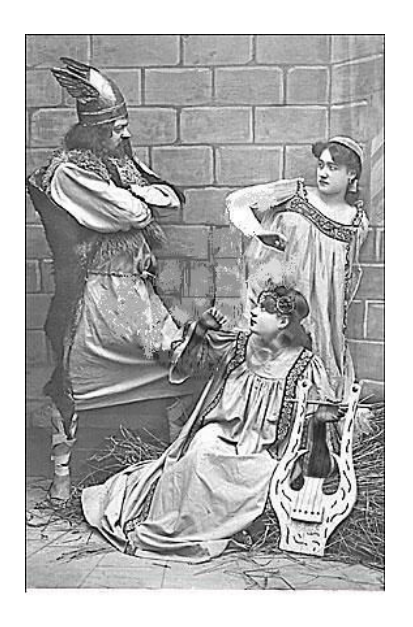
The Sword & The Plow